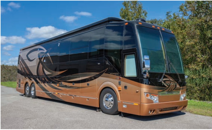
2014 MILLENNIUM H3-45 #718