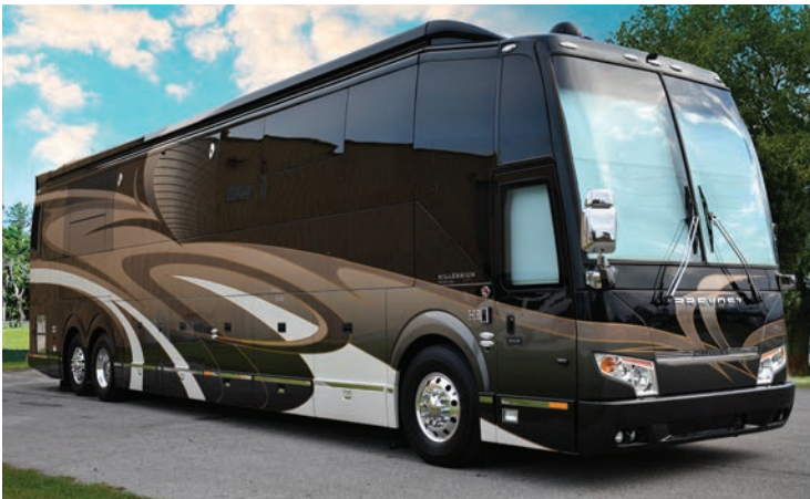
2018 MILLENNIUM H3-45 #719