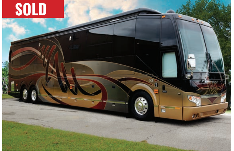
2018 MILLENNIUM H3-45 #737