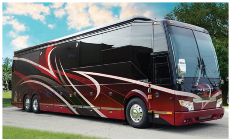
2014 MILLENNIUM H3-45 #741