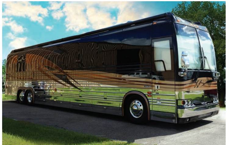
2008 MILLENNIUM XL2 #743