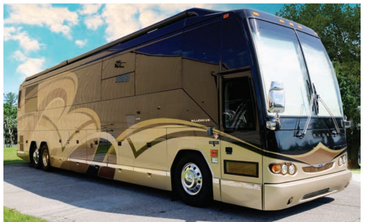
2008 MILLENNIUM H3-45 #728