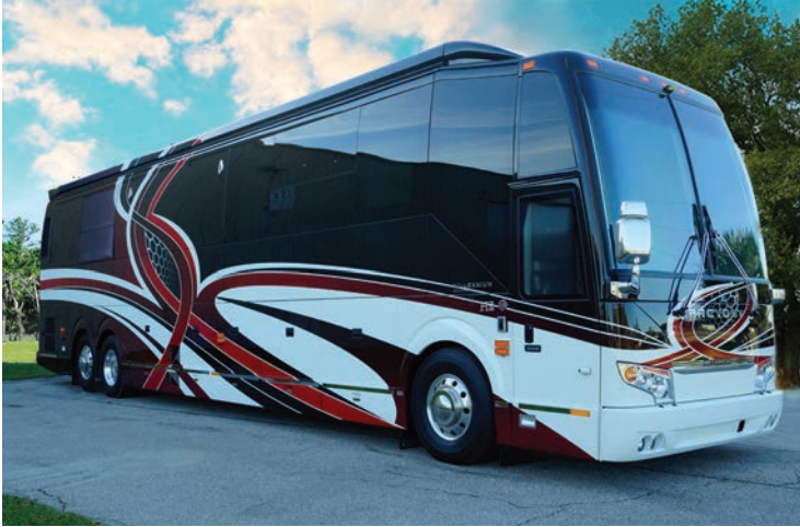
2021 MILLENNIUM H3-45 #10155