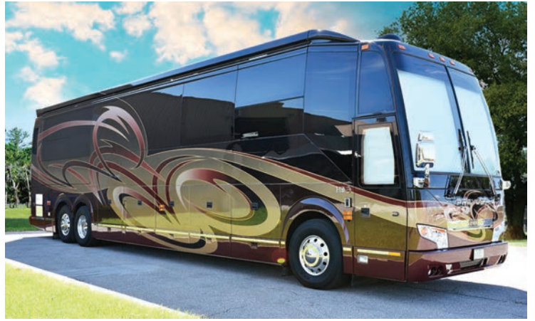
2013 MILLENNIUM H3-45 #720