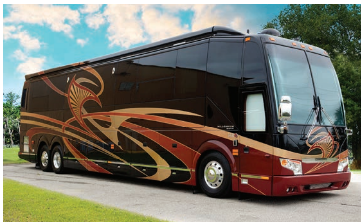
2015 MILLENNIUM H3-45 #731