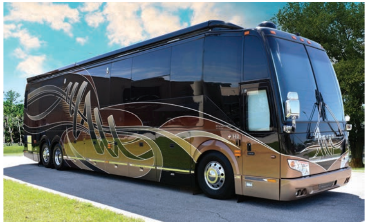
2017 MILLENNIUM H3-45 #3008