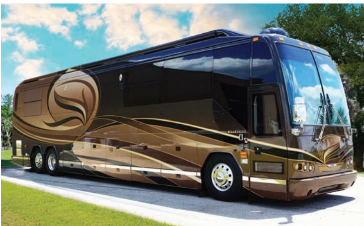
2008 MILLENNIUM H3-45 #732