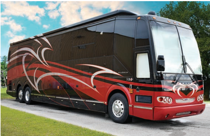
2010 MILLENNIUM H3-45 #735